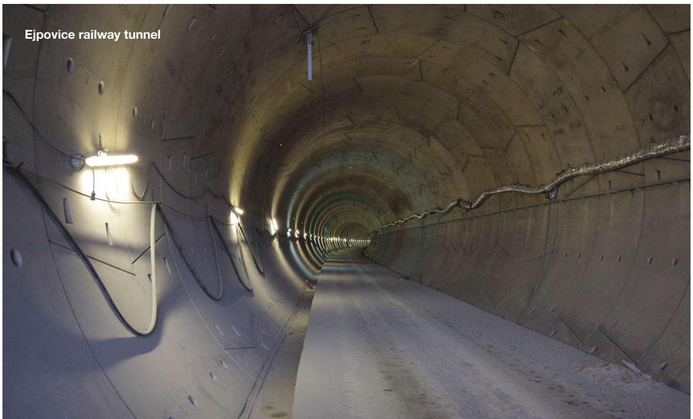
Ejpvovice railway tunnel