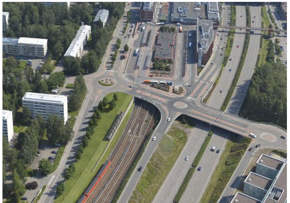
The Jokeri Light Rail Project