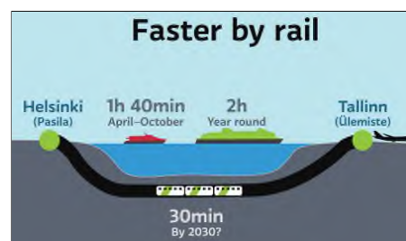
The FinEst Link