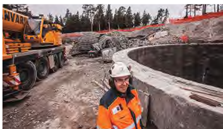
The Blominmaki wastewater plant