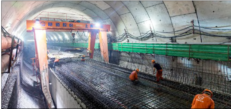
Badaling Underground Station

is by far the largest underground station for high-speed rail in the world. The crossover tunnel at both ends of the station has an excavation span of 32.7m and is the largest single arch span in China. At present, the total length of railway tunnels in China's construction planning reaches 15,634km.