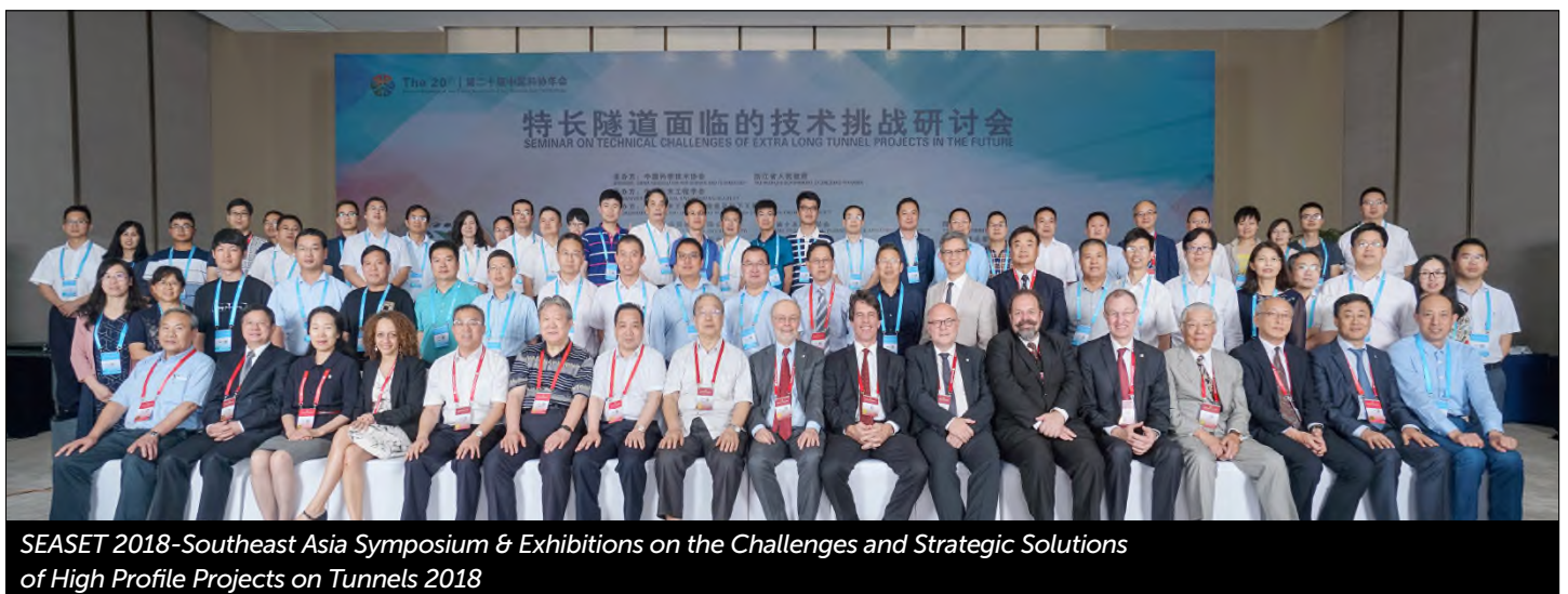
SEASET 2018-Southeast Asia Symposium & Exhibitions on the Challenges and Strategic Solutions of High Profile Projects on Tunnels 2018