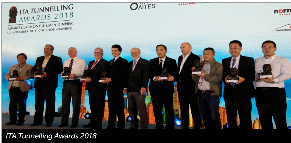
ITA Tunnelling Awards 2018

According to the latest rail transit network report, by the end of 2018, rail transit has become available in 35 cities in mainland China, with a total mileage of 5,766.6km (including 4,511.3km of metros). The newly added rail transit in operation reaches a length of 734.0km.