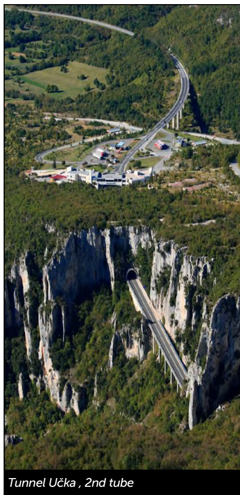
Tunnel Učka , 2nd tube