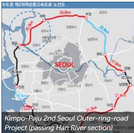
Kimpo-Paju 2nd Seoul Outer-ring-road Project (passing Han River section)