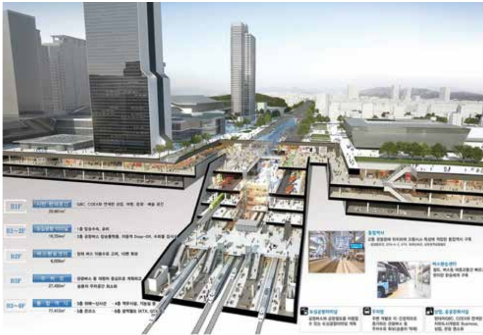
Youngdong Main Street Underground Complex Development Project