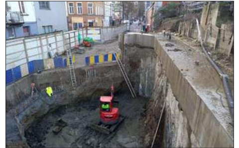
Several mechanized tunnels for stormwater drainage systems, energy and utilities