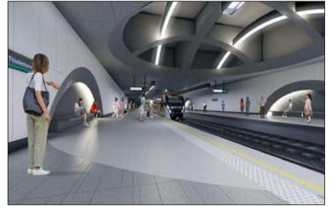
Extension of the Metro Line 3 from Brussels North to Bordet