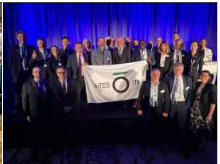
TAC 2023 at the Westin Harbour Castle in Toronto, Ontario