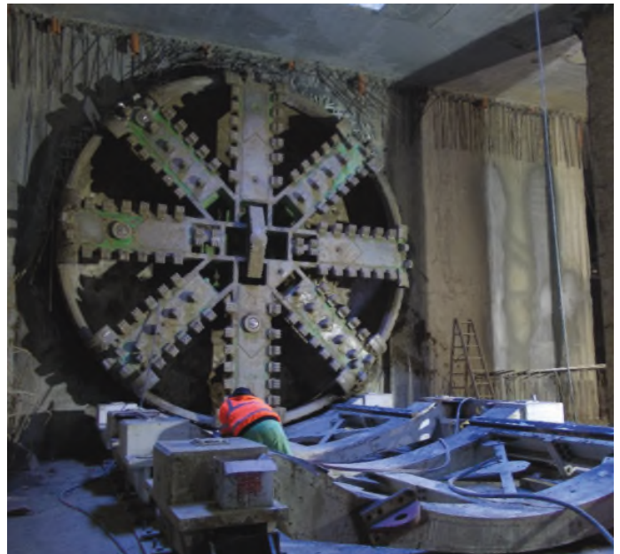
Metro Line 5: 1 st TBM preparation for passing through Eroilor 2 station.

Under works: 85% for railway, finishing, installations awarded to a JV formed by: Astaldi SpA, Alstom Romania, TIAB Sa, Aktor & Schindler.