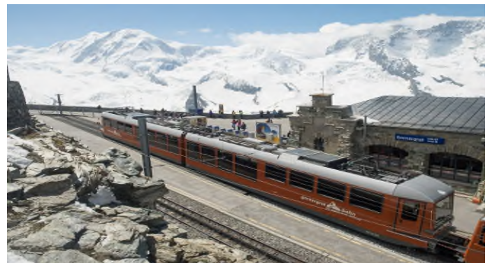
Meeting DACH in Zermatt, 29.09 - 1.10.2016