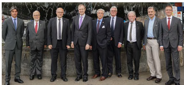
Swiss Tunnel Congress 2016, Lucerne – Advisory Board