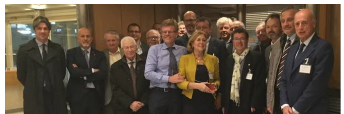
Meeting BEFIPS in Bologna, 21.10.2016