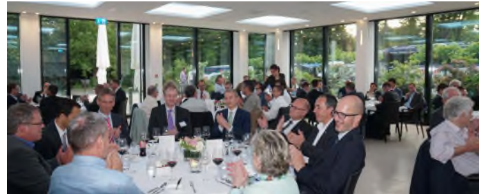
Evening with Guests and Sponsors STC 2016, Lucerne