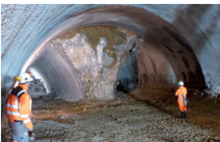
STS Fall Excursion 2016, 09.11.2016 Galgenbuck Tunnel, Schaffhausen