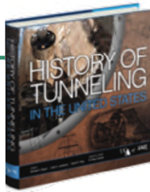
Above: History of Tunneling in the United States, just published and available now.