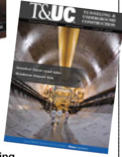
Above right: Tunneling and Underground Construction