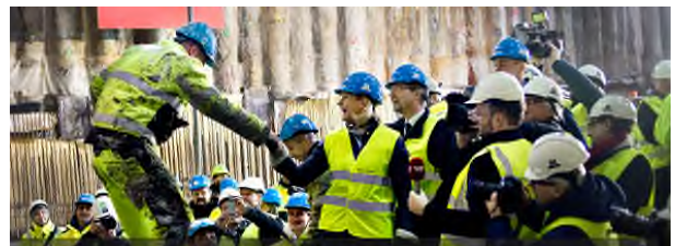
Copenhagen having 24 new underground stations

The construction works for the Cityringen metro lines continues. As of mid-April 2014 most of the stations has been excavated and 13 of 17 stations have had the base slab cast and internal concrete slabs and walls are in progress. Tunnelling from the Tømmergraven shaft towards the Copenhagen main station has successfully been completed with a double breakthrough of two TBMs into the Copenhagen Main Station box on the 29 January 2015. The breakthrough was witnessed by Danish Prime Minister Helle Thorning-Schmidt, see Photo below.