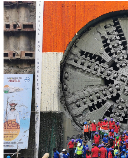
Φ12.19 m slurry TBM applied in M tunnel. Max. monthly advance rate was achieved.