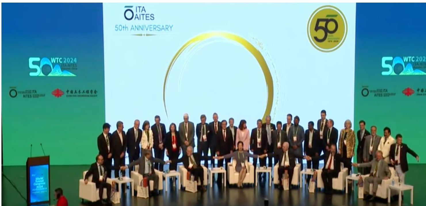
Image 10. Past and current ITA Presidents (seated) are joined on stage by current and past members of the ITA Executive Council