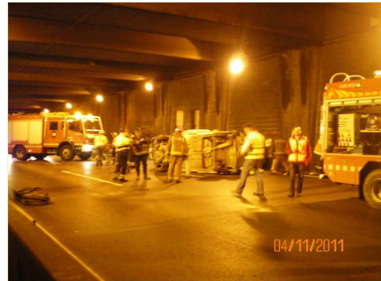
Tiana Tunnel Nov 2011