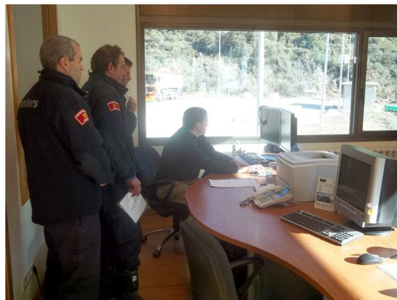
Erinyà, St Pere, Argenteria Tunnels (2,8km) Nov 2010