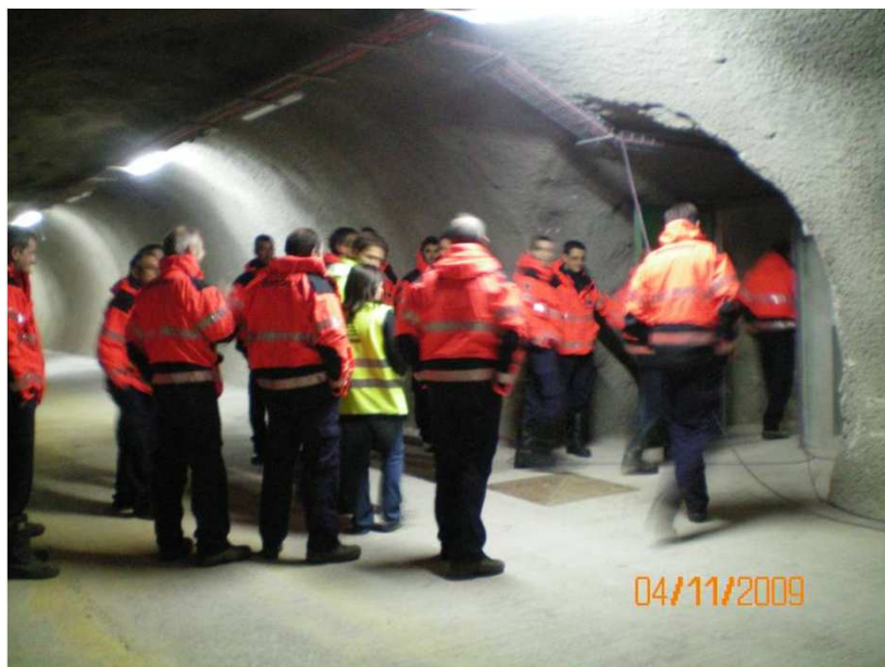
Mont-ros and Collabós Tunnels. 3,6 km Nov 2009