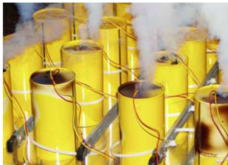
Bruc Tunnel Jul 2005