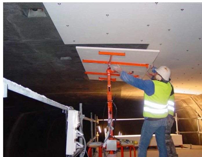
Portbou Tunnel Oct 2010