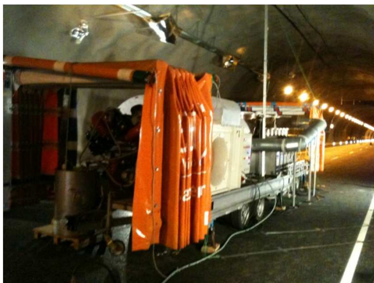
Mont-grès Tunnel Nov 2011