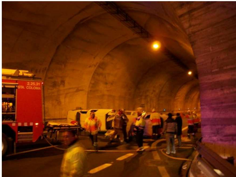
Mont-ros Tunnel Nov 2010